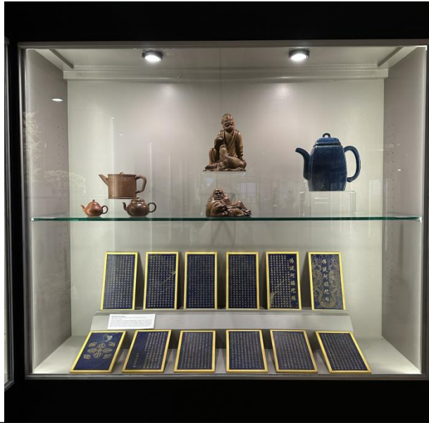
Cabinet of Teapots, Buddhist Sutras and Buddhas