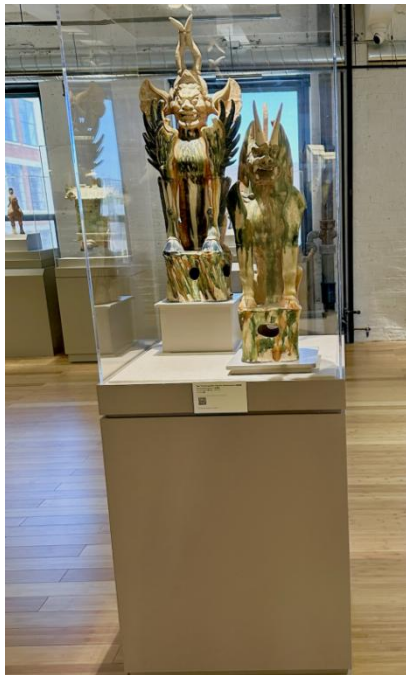
Cabinet for Tang Sancai Guardians

Bronze, from Eastern Zhou/Spring and Autumn Period (770–476 BC)