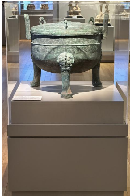
Cabinet for Bronze “Ding” 中國商朝青銅饗饗紋鼎

This cabinet contains the large Chinese black pottery jar Han Dynasty (206 BC–220 AD)