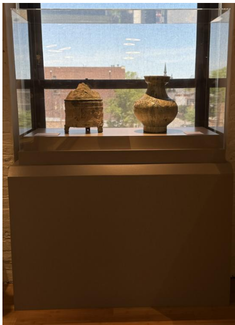
Cabinet for Han Dynasty Pottery Vessels

This cabinet includes a green glazed pottery Hill jar and a green glazed pottery wine vessel, both from the Han Dynasty (206 BC– 220 AD).