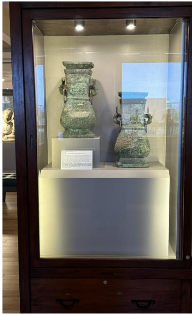
Cabinet for Pair of Fang Hu with Lids

Silver Sponsor $3,000 (Only 38 available)