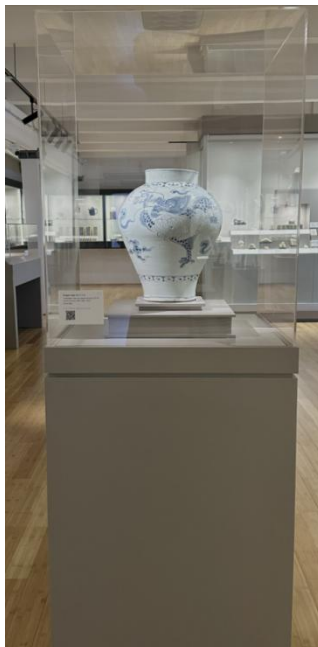
Cabinet for Korea Porcelain Dragon Vase, Underglaze blue decorated porcelain, Korea, Joseon Dynasty