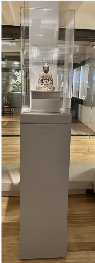
Cabinet for Carved Wood Bodhisattva 雕刻木菩薩像 Song–Yuan Dynasty, China