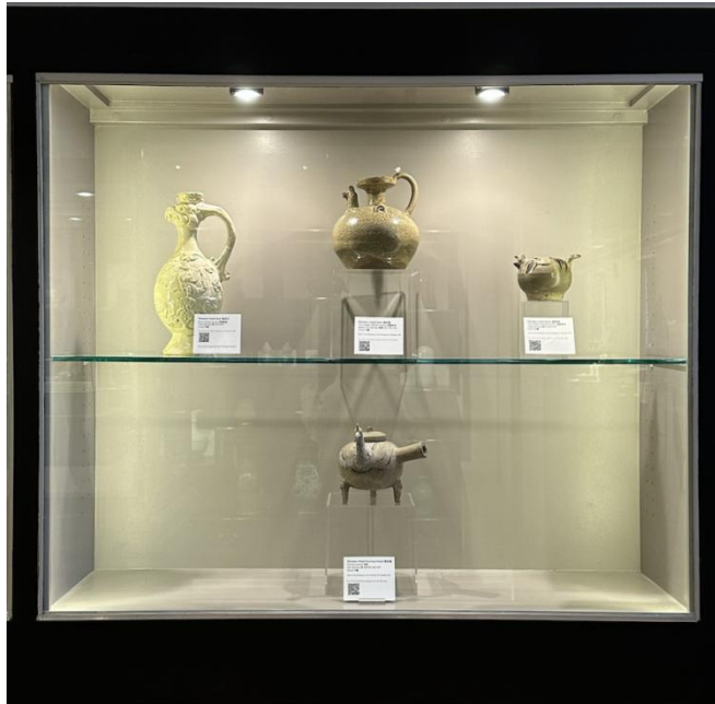
Cabinet for Chicken-Head Vessels. A collection of five chicken-head vessels, ranging from the Han Dynasty (206 BC– 220 AD), to the Tang Dynasty (618–907).