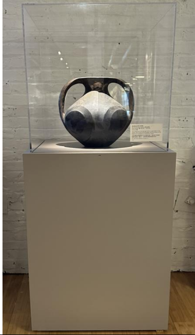
Cabinet for Large Han Jar 展櫃：中國漢朝時期黑陶罐（西元前 206 年–西元 220 年）

This cabinet contains the large Chinese black pottery jar Han Dynasty (206 BC–220 AD)