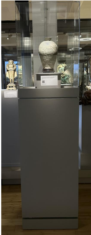
Cabinet for Plum Vase with Crysanthemum Design, Korea, 12th Century