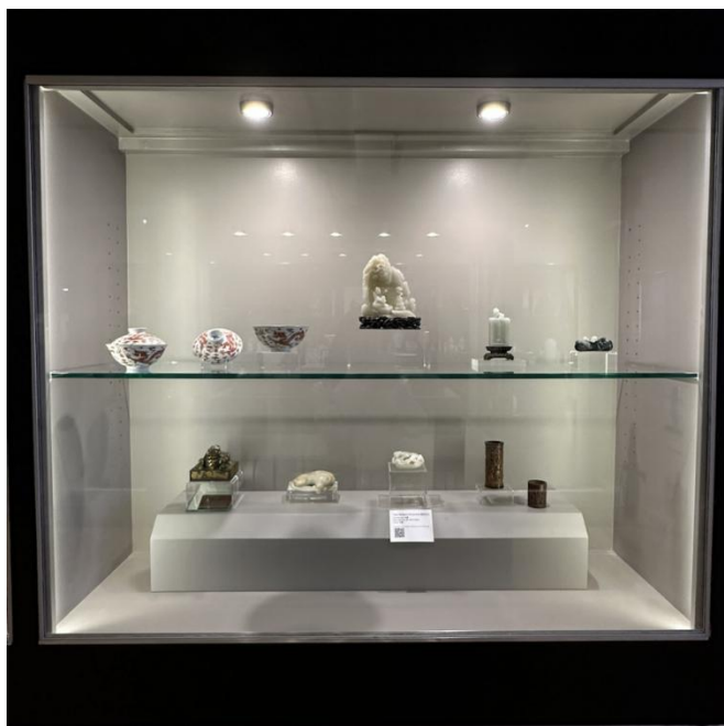
Cabinet for Qing Jade/Porcelain. This cabinet includes a twin badgers carved jade ornament from the Qing Dynasty, a pair of porcelain dragon bowls, additional carved jades, and a gilt bronze figure.